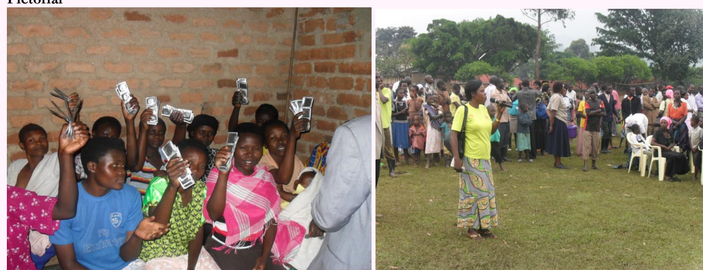
Left: Action is better than words: Young married women vow to be more cautious by using condoms with their suspiciously adulterous husbands. Right: An invited Guest gives a speech on WAD 2011 held at Magale Play Ground, Manafwa district.