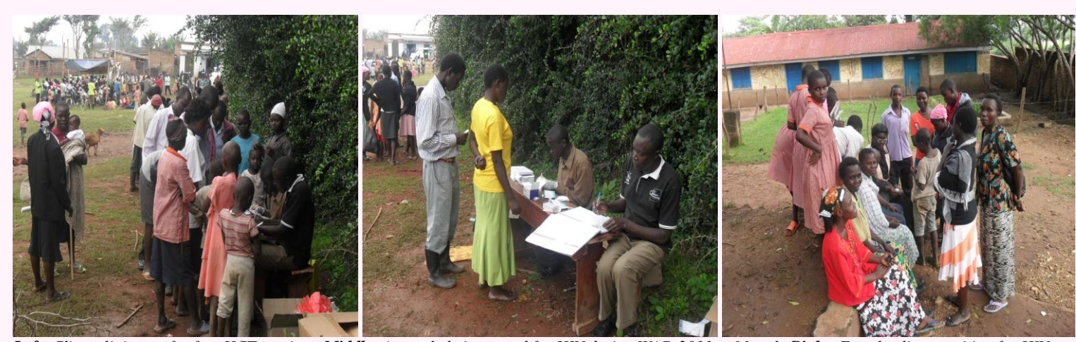
Left: Clients lining up for free HCT services. Middle: A couple being tested for HIV during WAD 2011 at Magale Right: Female clients waiting for HIV results.